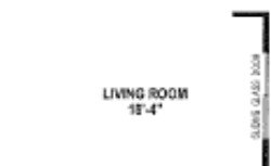
OPTION ENDWALL WS.G.D.